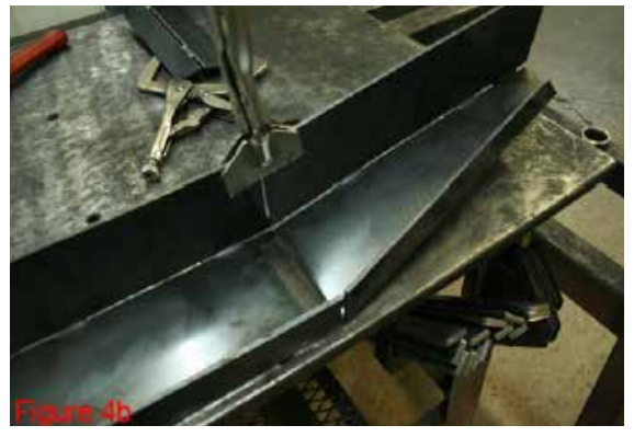
****Be sure to only tack the bumper together at this point. ****