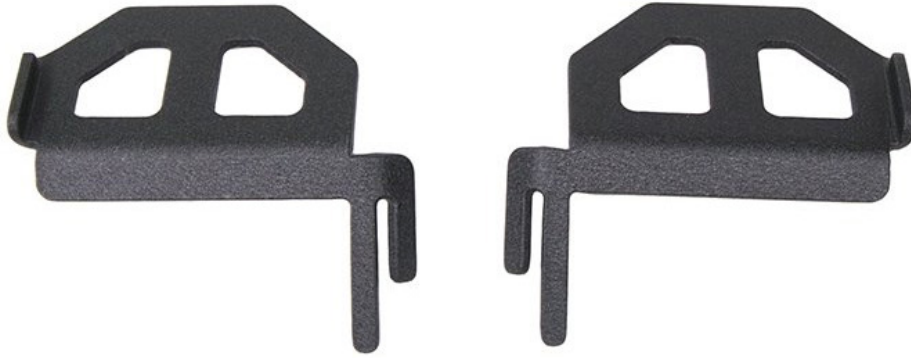
Foot Pegs Left and Right