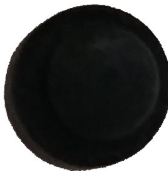
Rubber Stop X2