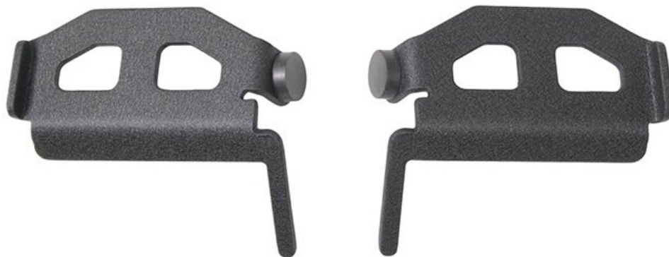
Foot Pegs Left and Right