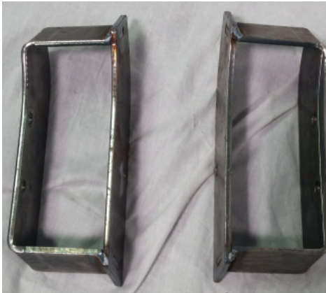
Rear Lower Bracket