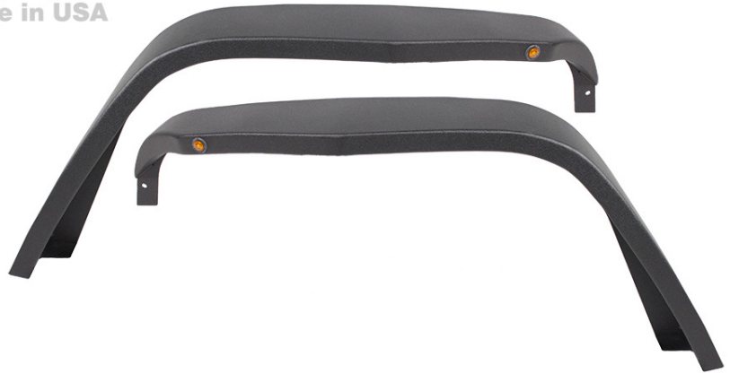
Fenders Left & Right *May differ from photo*