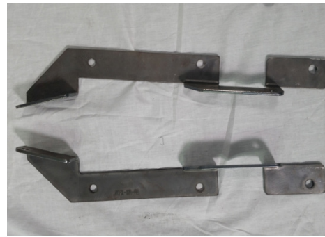
Front Upper Bracket