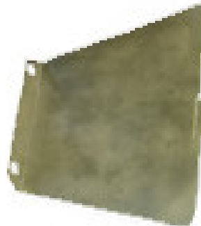
Rear Panel 2 Left and Right