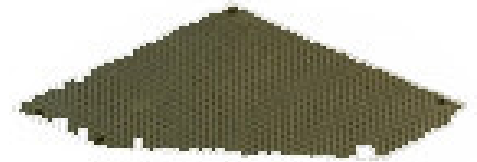
Perforated Panel X2