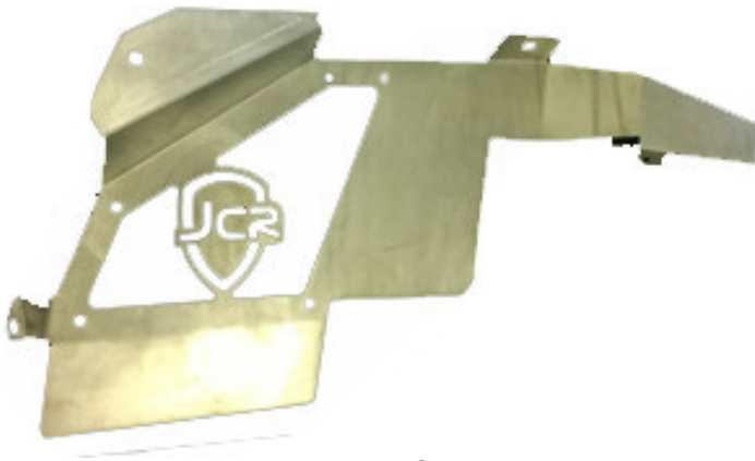
Front Panel Left and Right