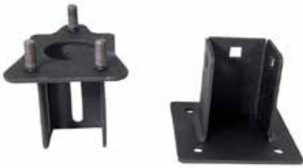
Tire Mount Part 1 & 2