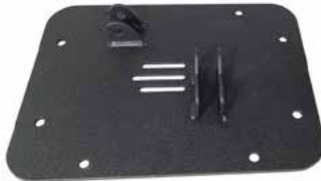
Carrier Tailgate Plate