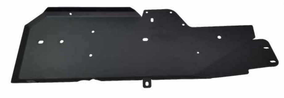
Two (2) Door