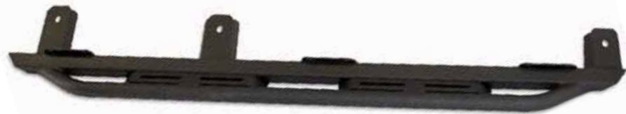
Four (4) Door