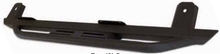
Two (2) Door