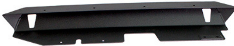
Slider Left and Right