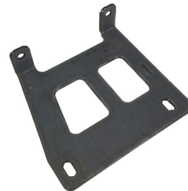
YJ Under Seat Bracket Left and Right