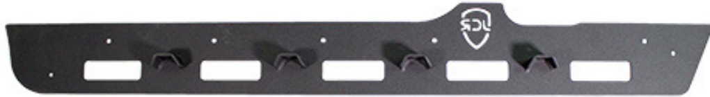
Body Mount Plate Left and Right