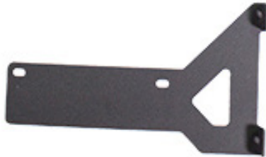
TJ/ LJ Under Seat Bracket Left and Right